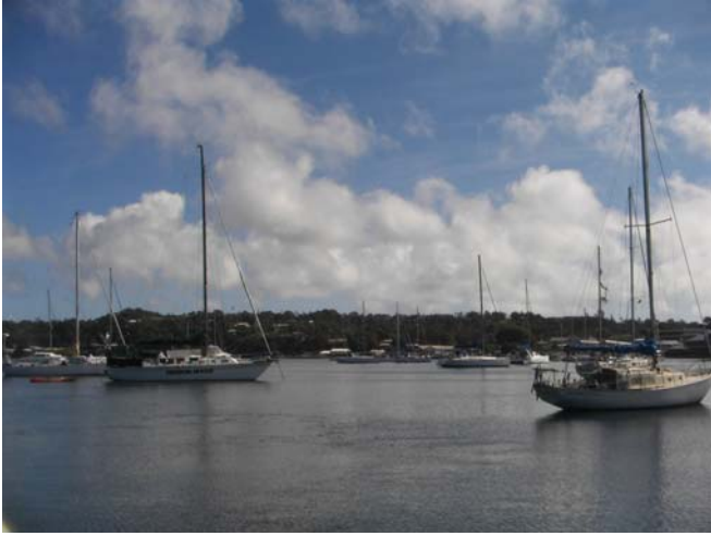
Neiafu Harbour, Vavau

Well they have free wireless internet here, so this comes to you courtesy of The Aquarium Café.