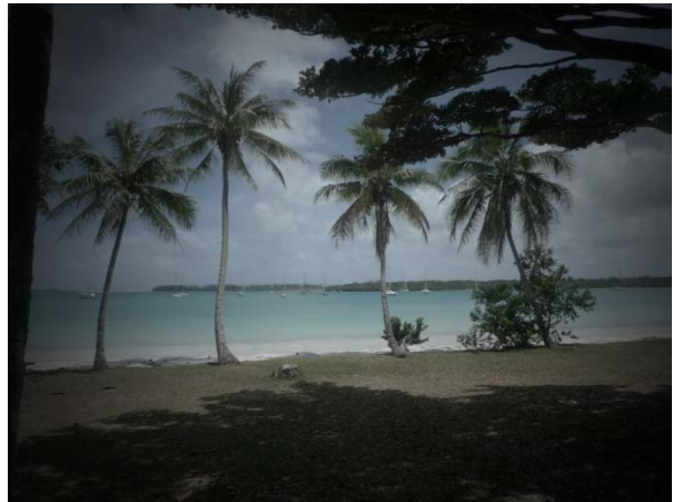
Les Pins Colonnaires