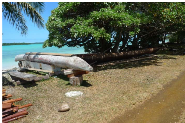
Pirogue (dugout) manufacture Baie St Joseph