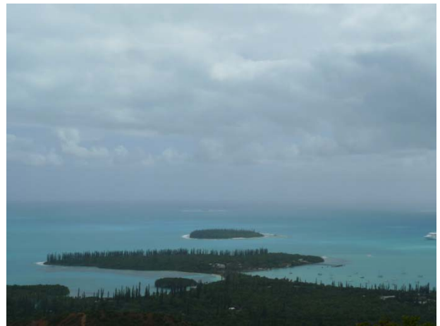
View from Pic Nga above Kuto