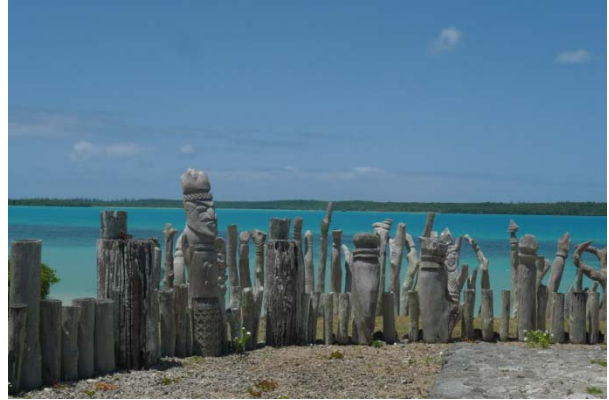
Baie St Joseph