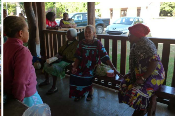
L'Eglise a Vao