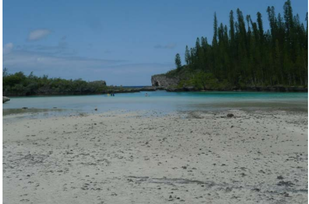
Le Piscine Naturelle Baie D'Oro