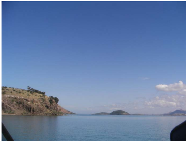
Tough, eh !