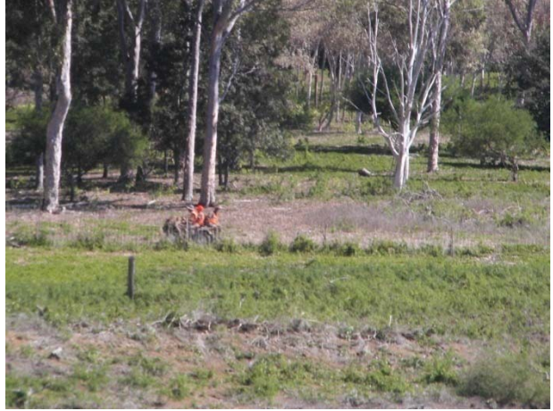
3 guys, 2 deer on 4x4