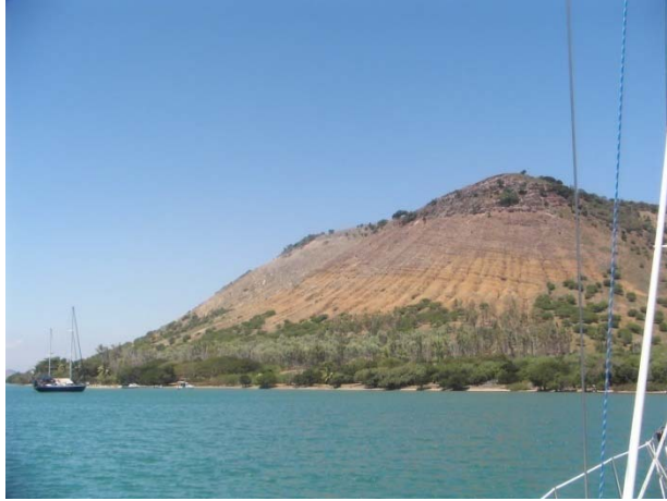
Blue Bird ....strange erosion on hill