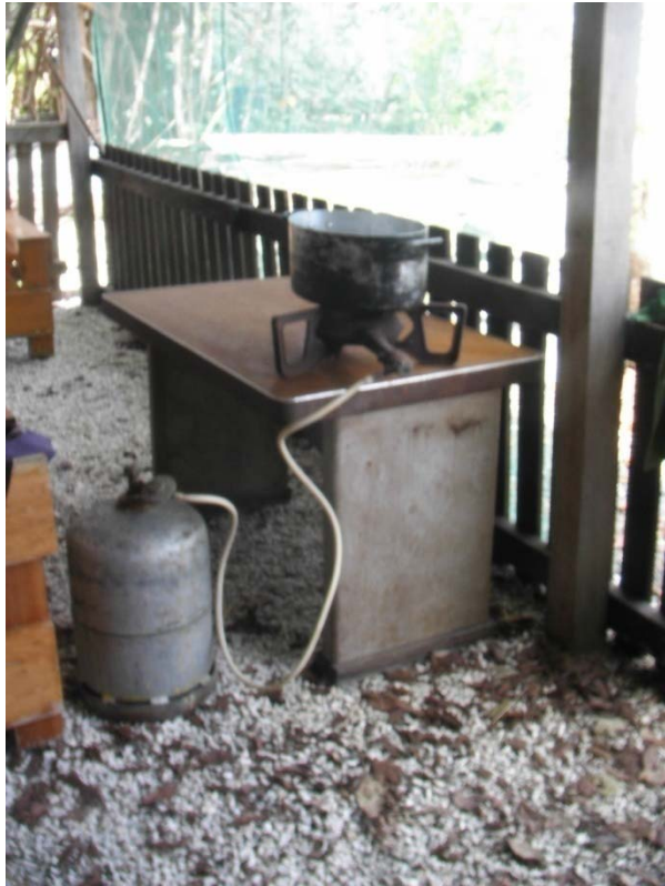
La cuisiniere sophistique