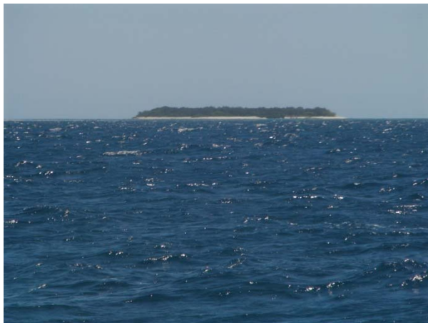
On the way north