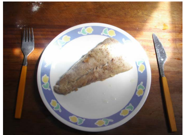
11 meal size fillets for the freezer