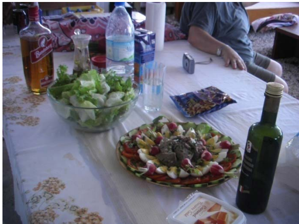
Salads, oil....and rum ?

Danielle turned up with more stuff...and we had LUNCH.....they all crash for a siesta, I go for a walk along the beach.