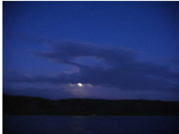
Evening at L'Onguet