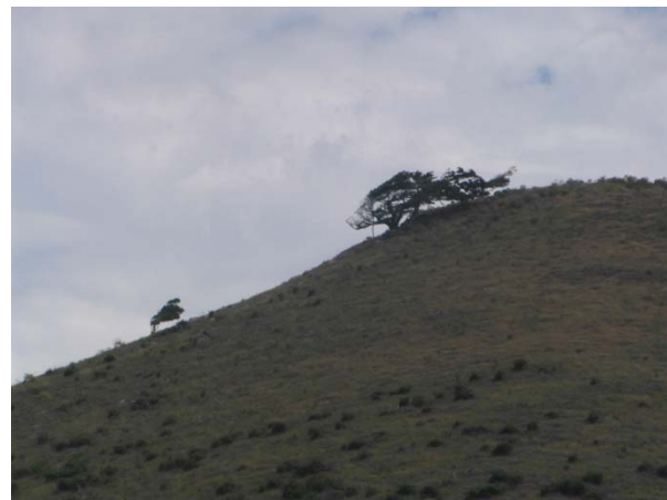
Trees grow at strange angles due to continual SE wind

Message on the phone from Judith saying that her friend (Jane)'s mum died...she was 100 !