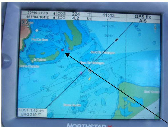
Entering Havannah Canal

Well it wasn't happening that way so we stopped at Baie Ire on Isle Ouen at 1500 and stayed overnight..the rest was worth it.